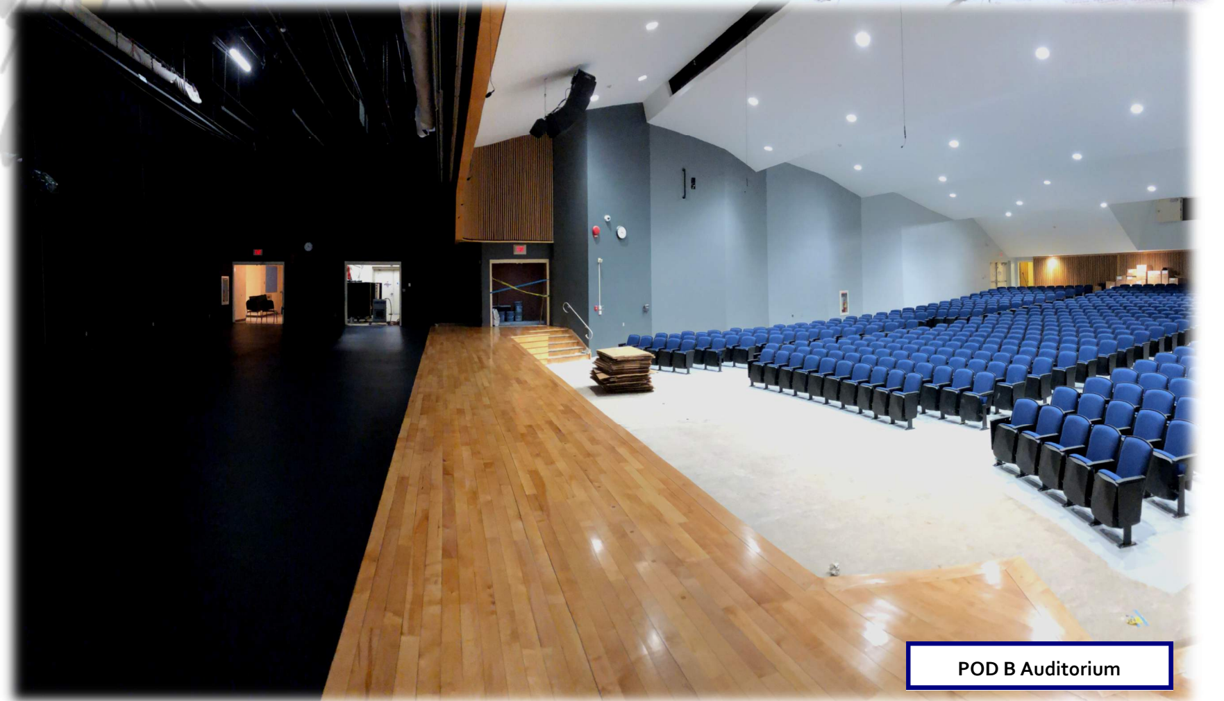
POD B Auditorium