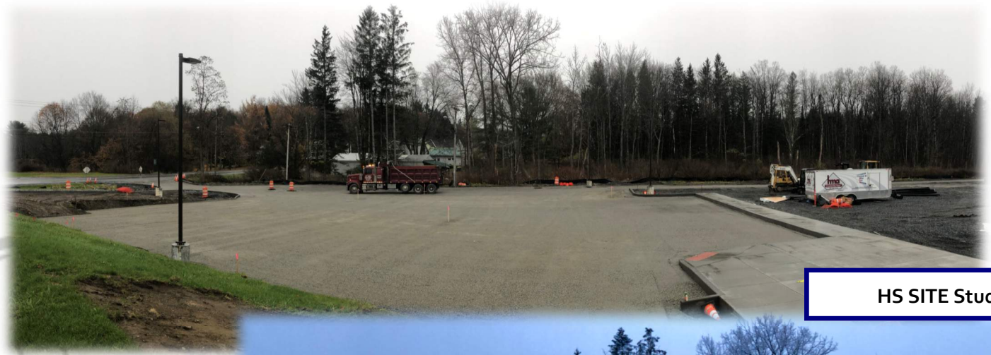
HS SITE Student Parking Lot