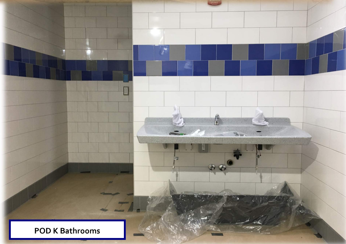
POD K Bathrooms