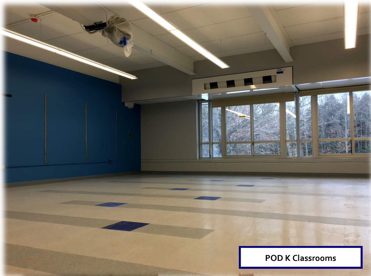
POD K Classrooms